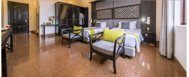
JUNIOR SUITE – TWIN BEDS