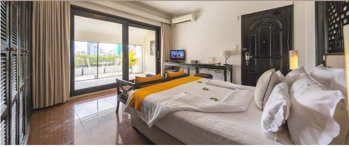
DELUXE ROOM – QUEEN BED