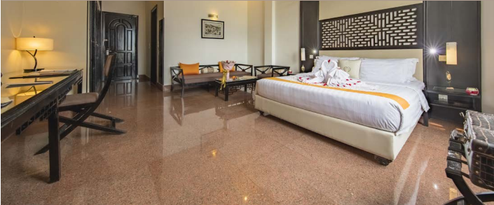
JUNIOR SUITE – KING BED