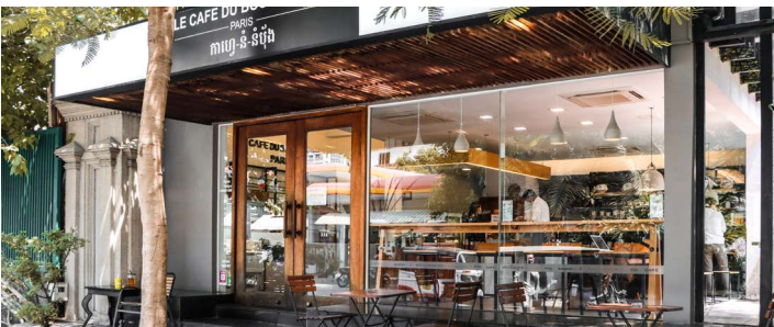
Le Café Lounge