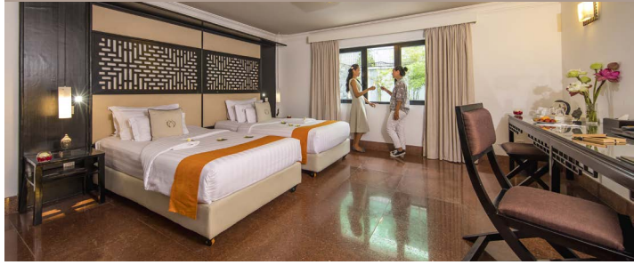
DELUXE ROOM – TWIN BEDS