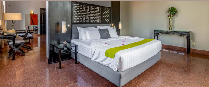
WM SUITE – KING BED